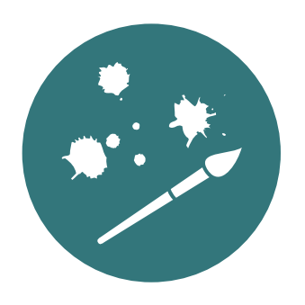
VIEWING ART/ LISTENING TO MUSIC

For beginners, the simplest form of meditation is breathing. Deep breathing can easily be done anytime of day. The goal of a breathing meditation is to allow the mind to rest from thoughts, which means allowing thoughts to pass through, rather than tending to each one as it enters the mind. Learning to be present is the goal of meditation.